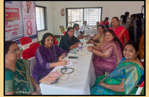
Health check up for Womens On International Womnes Day by RC Pachora