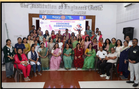
The Rotary Club of Nagpur Green City organized a Cooking Competition in collaboration with nine Rotary Clubs, one Inner Wheel Club, and Matra Kitchen.