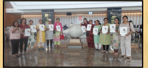
Rotary club of Nagpur Green City Organised cancer check-up camp under Ayushamati Yojana at National Cancer Institute NCI Nagpur, in collaboration with the Inner wheel club of Nagpur South