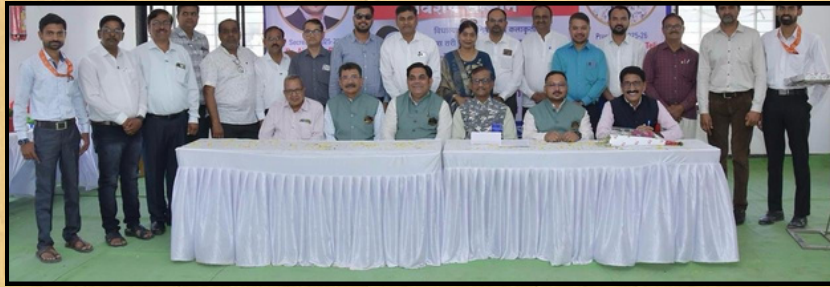
Governors visit to RC Pachora Bhadgaon