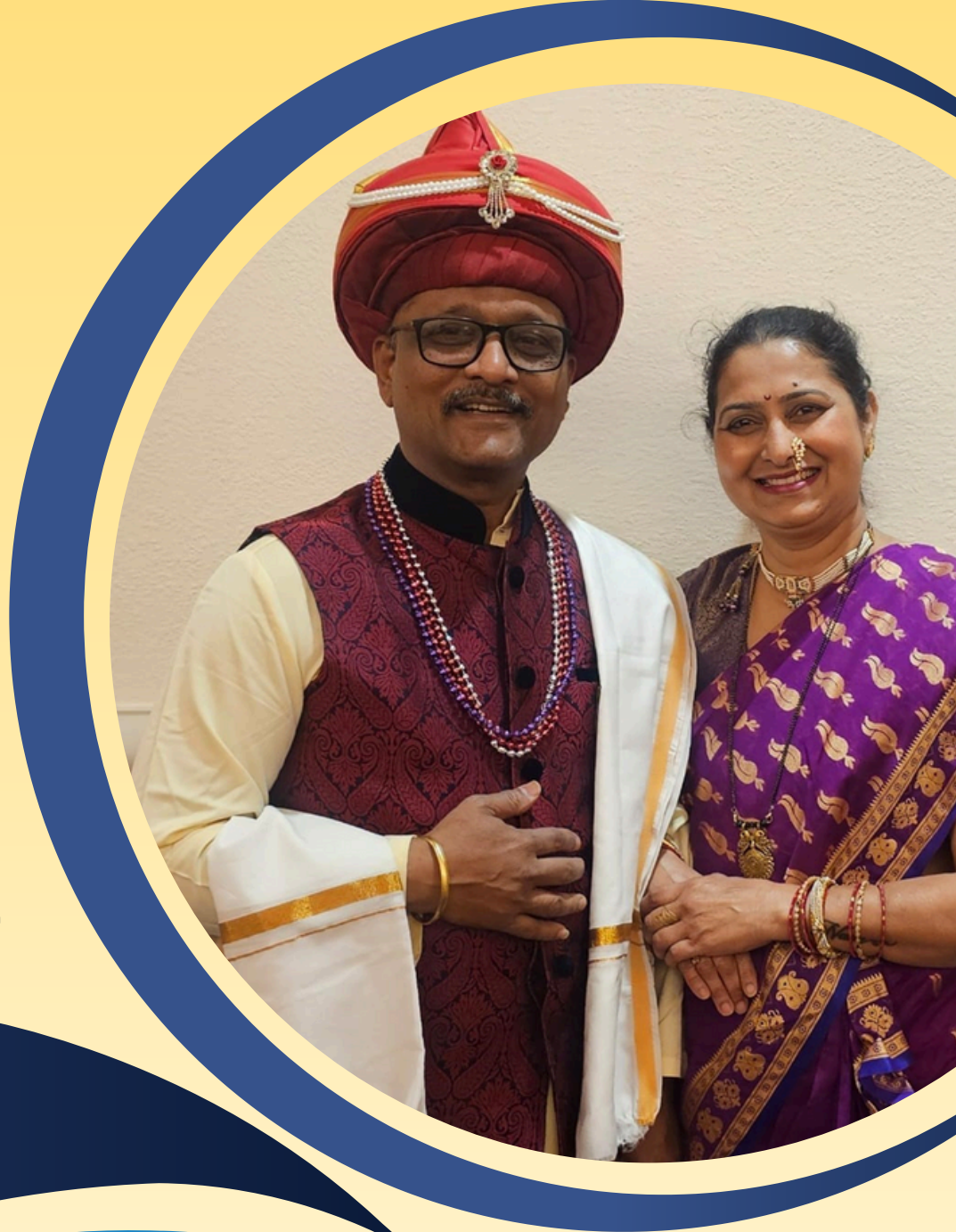
Anupama Shewale First Lady