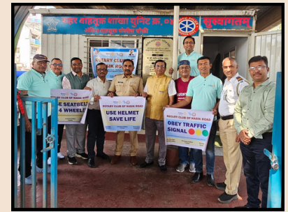
An extensive Traffic Rules awareness Programme was launched at most busy traffic signal of BYTCO Point at Nasik Road - Rotary Club of Nasik Road