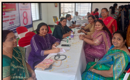
Health check up for Womens On International Womnes Day