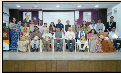
RC Nasik has a tradition of honouring professionals from different walks of life by giving them "vocational" awards.