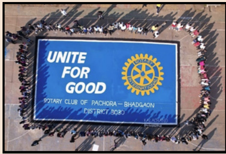
Rotary Club Pachora Bhadgaon drawn UNITE FOR GOOD Rangoli of 3450 sq ft, 9 hours, 20 Rangoli Artist, 1550 kg Rangoli made hige record in INDIA and ASIA BOOK OF RECORD