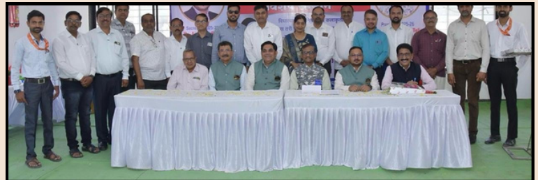
Governors visit to RC Pachora Bhadgaon