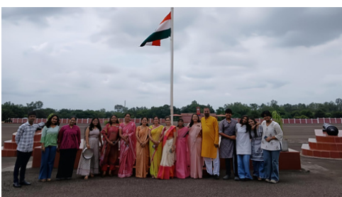
Raksha Bandhan with soldiers, R.C.Nasik East