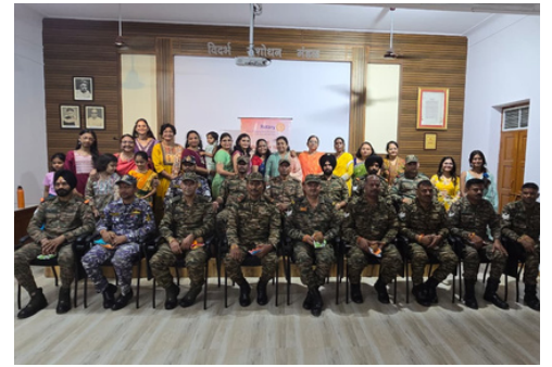
Raksha Bandhan Celebrated with the Jawans by Rotary Club of Nagpur Mihaan Town