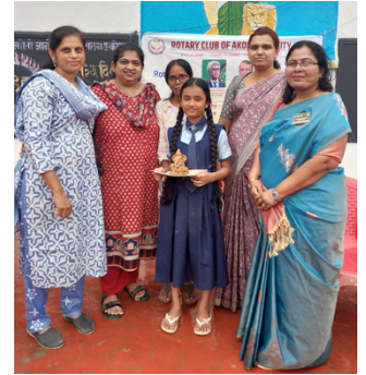
Eco friendly Ganesh idol making workshop at Jyoti Vidyalay, Rotary Club of Akola Agro City