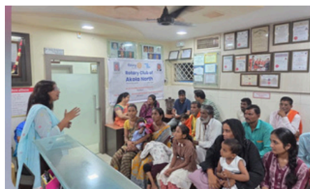
Workshop on world Breast feeding Rotary Akola North