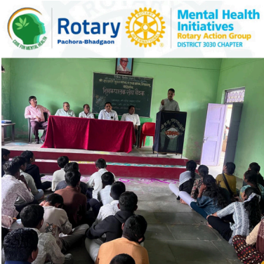
Mental health seminar Rotary club of Pachora Bhadgaon