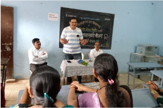
Dental Checkup Camp for 125 Students, Rotary club of Jalgaon Gold City