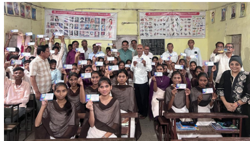
Rotary Club Pachora Bhadgaon arranged 3 programmes at 3 different schools on Primary Education and Literacy, Club