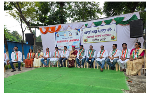
Patriotic song singing program in the District Jail, Rotary Club of Chandrapur