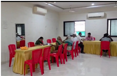
Rotary club of Amalner awareness of Ayurvedic therapy