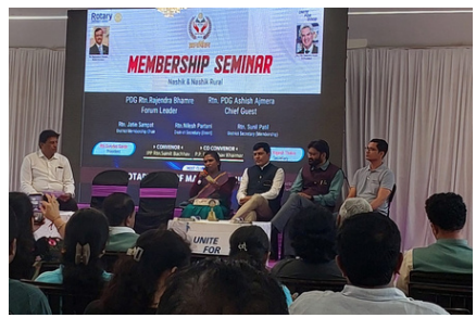
Organized by Rotary Club of Malegaon Midtown