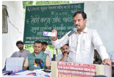
Rotary club of Chalisgaon Ideal study app distribution