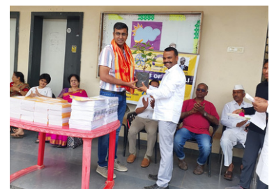
Installation of RCC, Rotary Club of Deolali