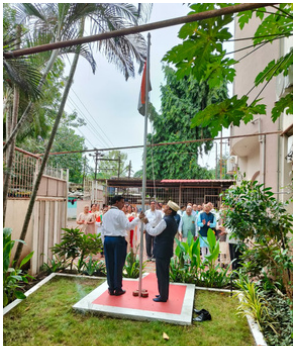
Rotary club of Malegaon celebrated 79th independence day at Rotary Eye hospital