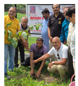
Rotary club of Akola East Tree Plantation