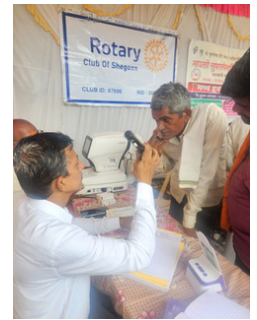
Eye Check up, Rotary Club of Shegaon