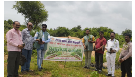
Tree Plantation Rotary club of Bhadravati