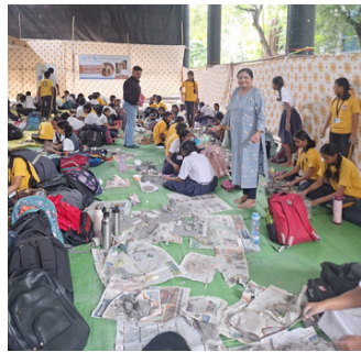
Eco-Friendly Ganesh Idol Making Contest by Rotary Club Nagpur South