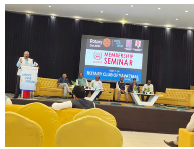
MEMBERSHIP SEMINAR AT YAVATMAL