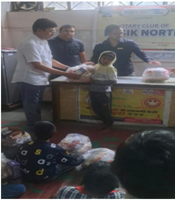
Rotary Club of Nashik North distribution of Protein powder