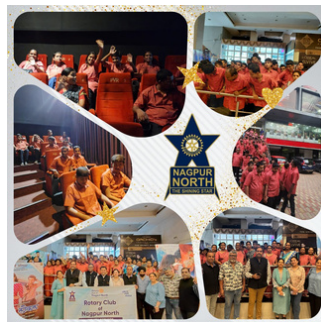
Movie Experience – "Sitaare Zameen Par" with special children