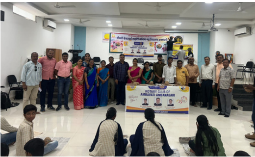
Eco friendly Ganapati Making Workshop, Rotary Club of Amravati Ambanagari