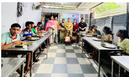
Shri Krishna Janmashtami Celebrations with special children. Rotary Club of Nagpur Elite