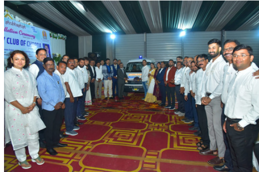
Donation of Ambulance, Rotary Club Chopda.