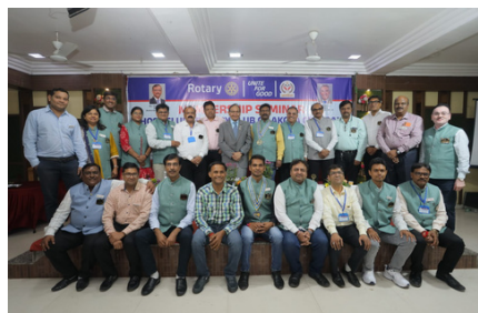
District seminar on Membership development Rotary club of Akola Central