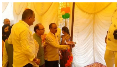
Rotary club Hinganghat celebrated Independence Day by organising blood donation camp