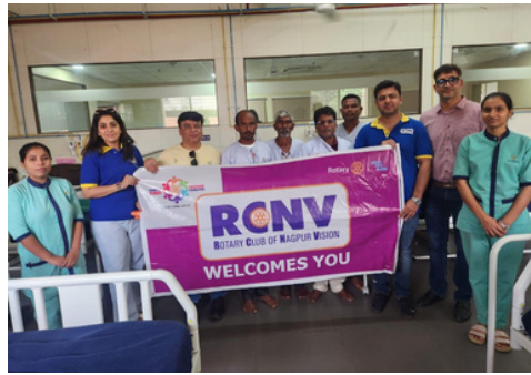
Follow up of Sparsh Camp, Rotary Club of Nagpur Vision